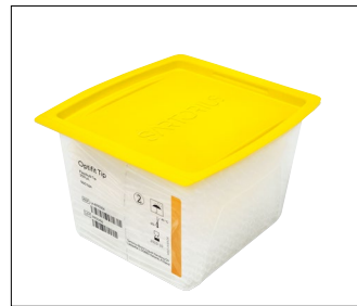
FlexiBulk ® Pack